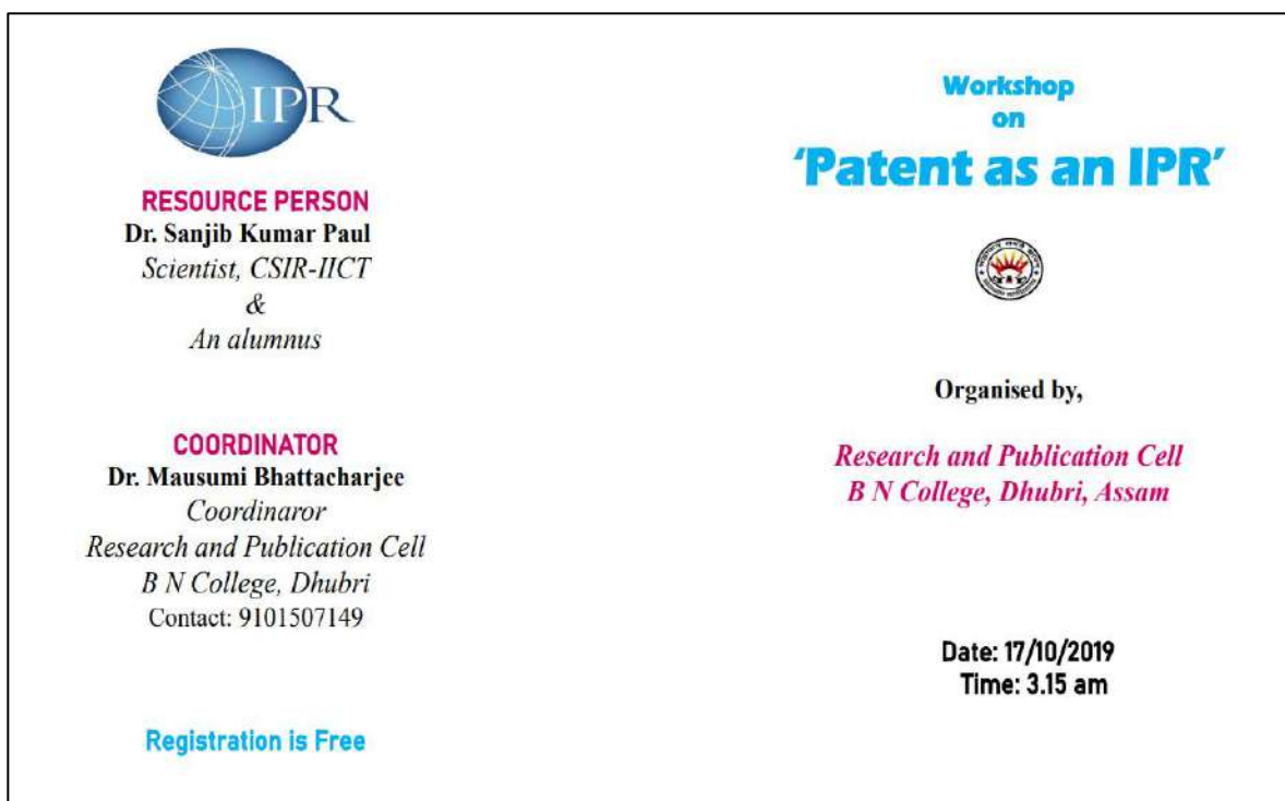
Brochure of the programme