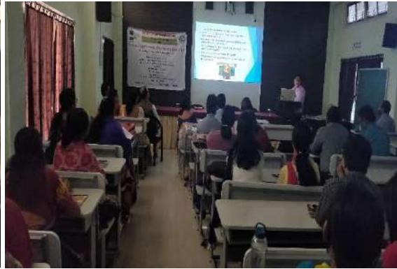
Faculties participating the Workshop