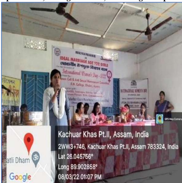
A Student of B. N. College, delivering lecture