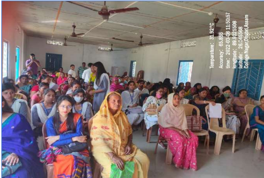
Participants present in the Programme