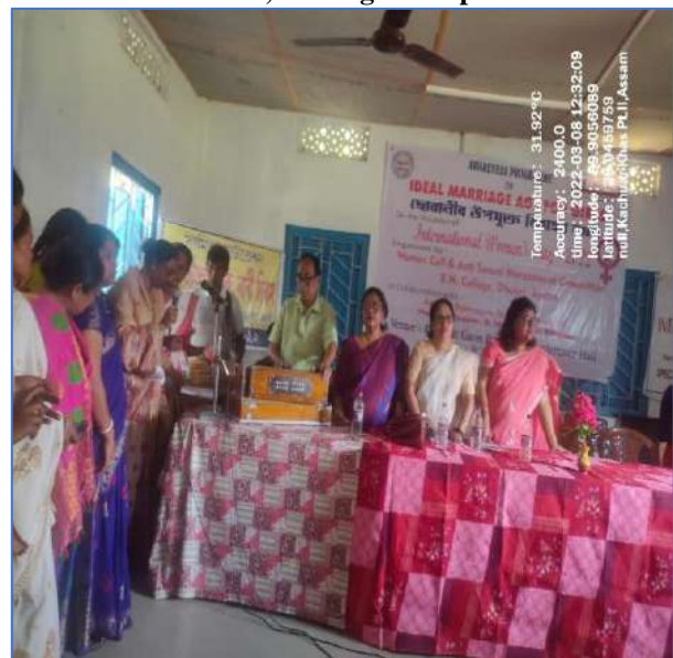
Awareness through songs