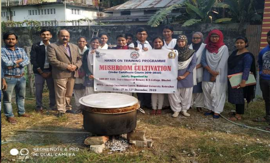
REBMEI NOTE 6 PRO MI DUAL CAMERA