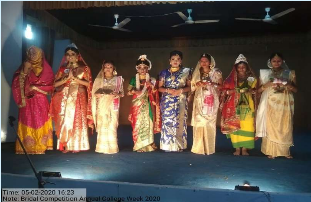
Time: 05-02-2020 16:23 Note: Bridal Competition Annual College Week 2020

Eligibility : The candidate must have passed Higher Secondary or equivalent examination from Science/Arts/Commerce. Students who have passed the Higher Secondary examination with either Mathematics or Computer Science as one of the subjects obtaining minimum pass marks in the subject will be given preference. Students completing Diploma in CSE/ IT from AICTE recognized institutes are also eligible for admission.