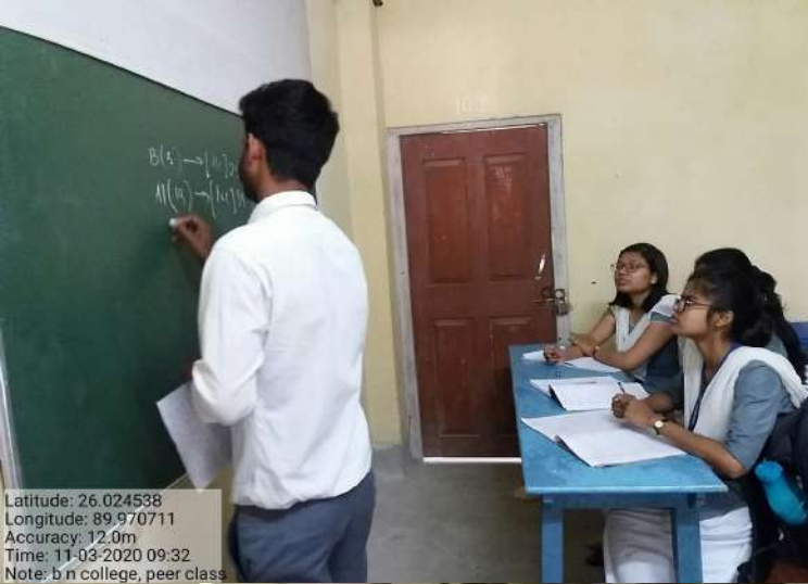
Latitude: 26.024538 Longitude: 89.970711 Accuracy: 12.0m Time: 11-03-2020 09:32 Note: b n college, peer class