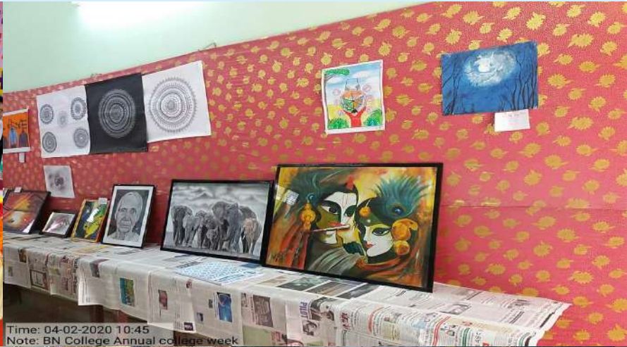
Time: 04-02-2020 10:45 Note: BN College Annual college week