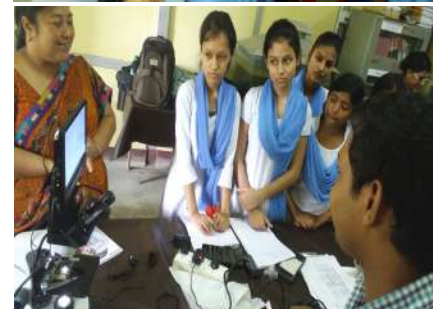
Students of the feeder school of Dhubri Town visit the college Laboratory and SNT Library as part of Organic Linkage Programme between the college and the feeder schools.