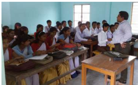
The college is continuing the Organic Linkage Programme with the Feeder Schools of Dhubri Town for the Academic Session 2016 - 2017