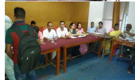
Teachers of the college at the Help Desk and Admission Process during the admission days