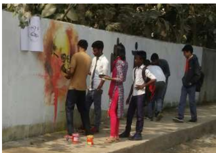
Students busy in Wall Graffiti on the occasion of "Swachch Bharat Abhiyan" 2017.