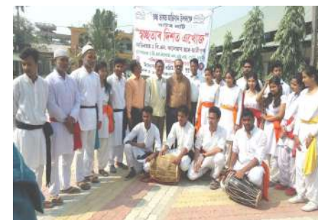
Street Play Team poses with honourable principal of the college.