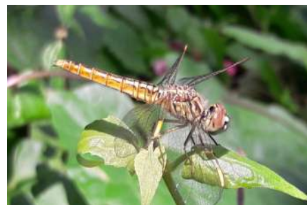
Best Photograph of "On the Spot Photography competition" in connection with World Environment Day 2017 clicked by Rishab Paul of B.Sc. 3rd Semester, Roll No. 960.