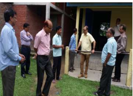
The college family visits the L.P. School of its adopted Village.