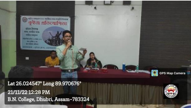
Lat 26.024547° Long 89.970676° 21/11/22 12:28 PM B.N. College, Dhubri, Assam-783324