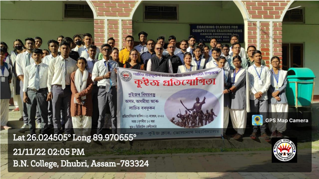
Lat 26.024505° Long 89.970655° 21/11/22 02:05 PM B.N. College, Dhubri, Assam-783324