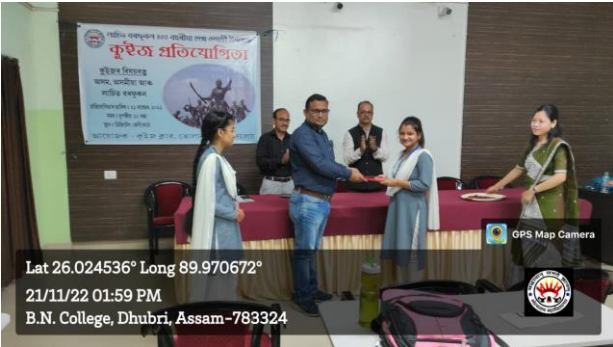
Lat 26.024536° Long 89.970672° 21/11/22 01:59 PM B.N. College, Dhubri, Assam-783324