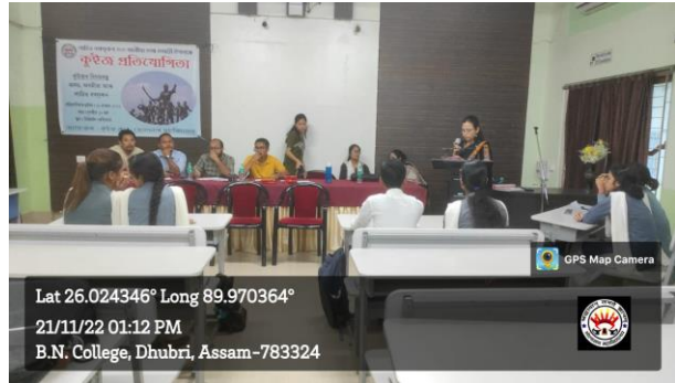
Lat 26.024346° Long 89.970364° 21/11/22 01:12 PM B.N. College, Dhubri, Assam-783324