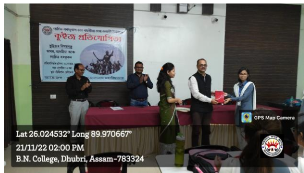
Lat 26.024532° Long 89.970667° 21/11/22 02:00 PM B.N. College, Dhubri, Assam-783324