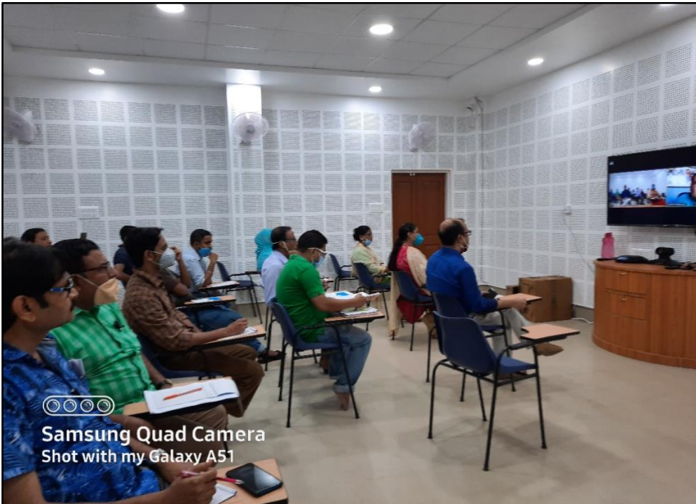
Shot with my Samsung Quad Camera Shot with my Galaxy A51